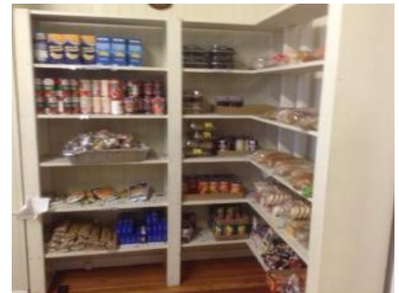
Recent food drives by local schools have helped fill often-empty shelves.